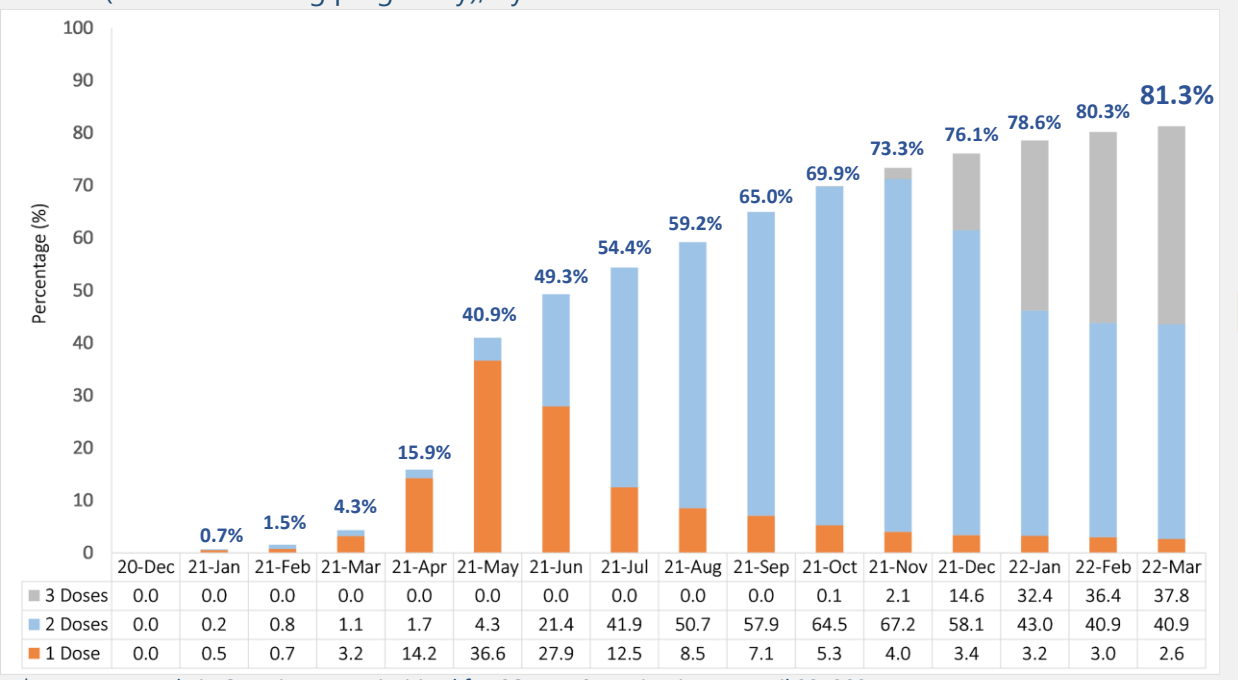
FIGURE 1. Estimated percentage of pregnant people who had received at least one COVID-19 vaccine (before or during pregnancy), by calendar month

Pregnant individuals are considered a high-risk population for COVID-19 complications, based on higher rates of COVID-19 hospitalization, intensive care unit (ICU) admission, and death compared with non-pregnant individuals. Since late April 2021, pregnant people in Ontario have been prioritized for COVID-19 vaccination as part of Phase 2 of the COVID-19 vaccine program implementation. To-date, vaccine coverage in pregnant individuals has remained lower than in the general population<sup>a</sup>. The Better Outcomes Registry & Network (BORN) Ontario (www.bornontario.ca) is evaluating COVID-19 vaccination in pregnant individuals in Ontario. This report shows data on vaccine coverage among individuals who were pregnant at any point between December 14, 2020 and March 31, 2022.